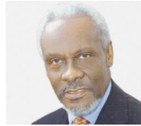
The Most Honourable PJ Patterson Statesman-In-Residence