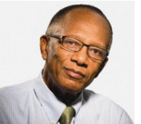
Professor Orlando Patterson Professor of History and Sociology, Harvard University