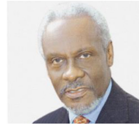
The Most Honourable PJ Patterson Statesman-In-Residence