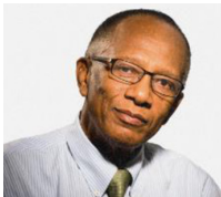
Professor Orlando Patterson Professor of History and Sociology, Harvard University